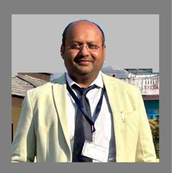
Message from Director

Dayal Upadhaya Gorakhpur University (DDUGU) is committed to offering international students a cutting-edge, professional, and valuebased educational environment that is both interdisciplinary and professional. The university boasts an NAAC A++ accreditation, due to its exceptional academic infrastructure, research credentials, extension activities, and innovative teaching pedagogy. DDUGU offers a wide range of programs in areas such as science, agriculture, management, law, pharmacy, engineering, biotechnology, mass communication, environmental sciences, and arts.